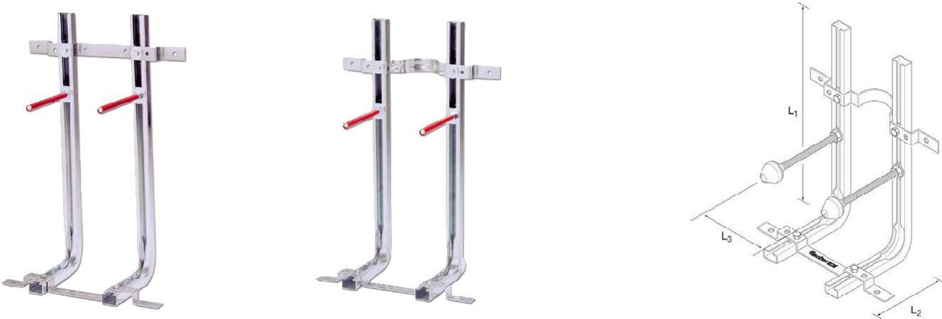
Universal pre-assembled system L Plus Universal pre-assembled system LC Plus